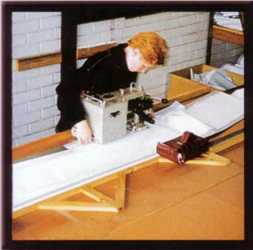
STATIONARY FLAT HEM WELDING AUSTRALIA